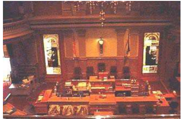
Colorado Senate Chambers