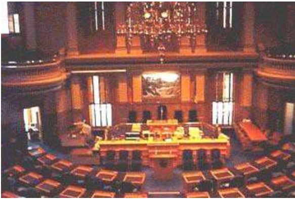
Colorado House Chambers

(A review of the Colorado State Laws affecting High School Activities Participation)